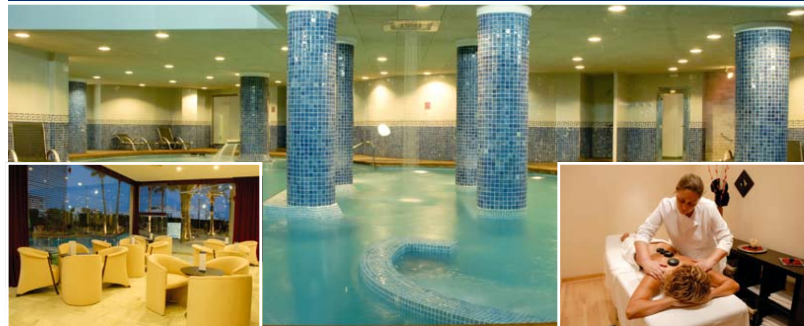
Luxury treatments in our spa: gold and pearl wrapping, geothermal, oriental and traditional massages