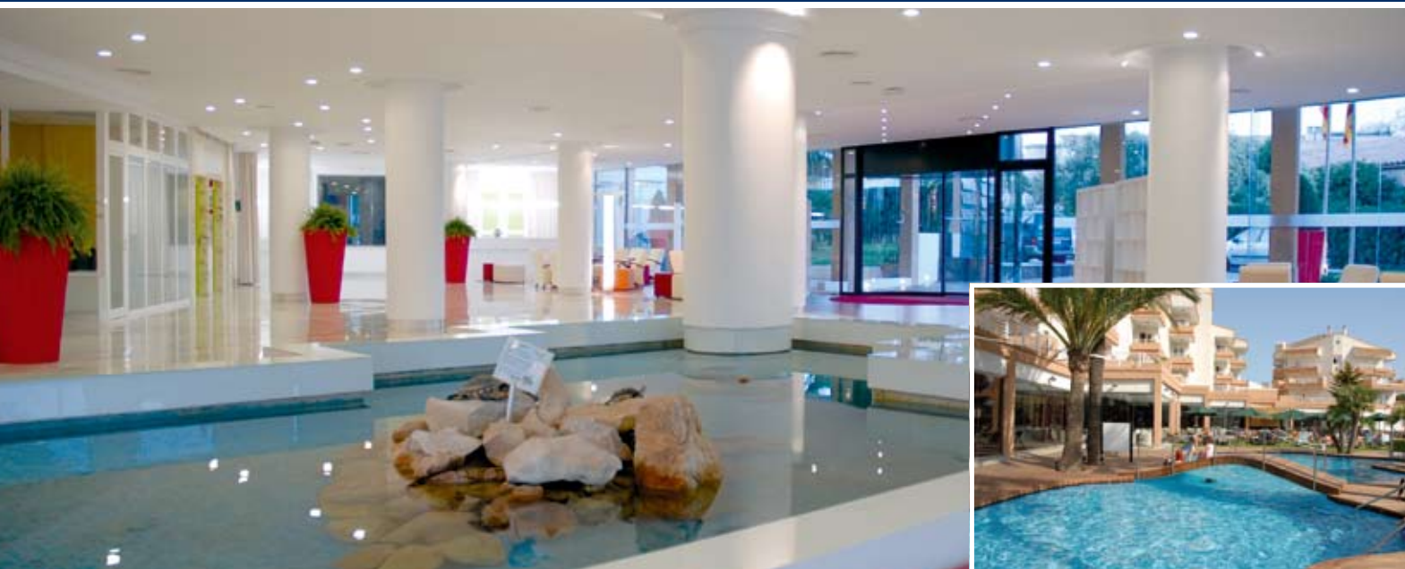
Modern hotel, illuminated by Murano cristall lights and with pools habited in noble wood

In our hotel, above all, we offer sensations