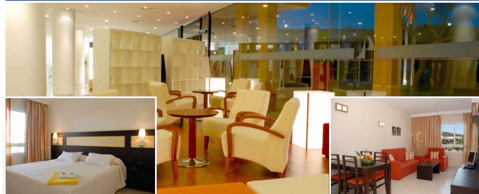
Apartments of 40 m 2 with plasma TV, kitchen with microwave, king-size bed and designer bathroom